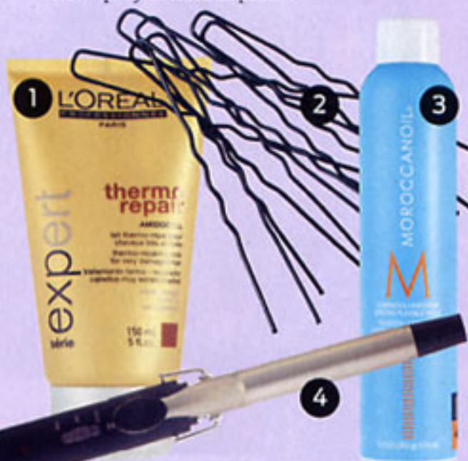
1 L'Oréal Professionnel Série Expert Thermo Repair, $26. 2 Hair FX 2" Fringe Pins in Black, pack of 60, $4. 3 MoroccanOil Luminous Hairspray, $34.95. 4 Remington Curl It, $22.95.

Apply styling cream and blow-dry hair using your fingers as a brush to create a natural wave. Use a wand to curl random sections at the back of your hair from mid-length down. Then create tighter curls in the front layers around your face. Brush hair into a side part, and pull out a few pieces at the front to gently frame your face. Tie the rest of the hair back in a loose bun and pin at the nape of your neck. Finish with a shimmering hair spray to hold in place.