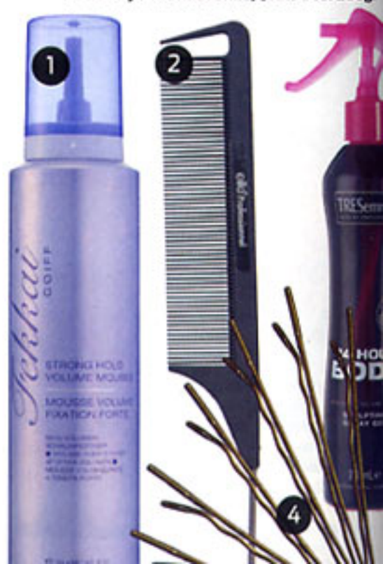
1 Frédéric Fekkai Coiff Strong Hold Volume Mousse, $46. 2 Elite Rat Tail Comb, $5.95. 3 TRESemme 24 Hour Body Sculpting Spray, $8.35. 4 Premium Pin Company 999 2" Bobby Pins in Bronze, $16.95 for 250g.

Prepare for the style by massaging a firm-hold mousse into towel-dried hair and blow-dry using a medium round brush. Backcomb small sections of hair from your crown to your hairline. Keep the front smooth by gently brushing hair back to keep height and slick sides back. To create a french roll, rake your hair back into a ponytail, twist the ponytail in an upward motion to achieve a rope effect, then tuck underneath into a roll. Secure with pins and finish with a strong-holding spray.