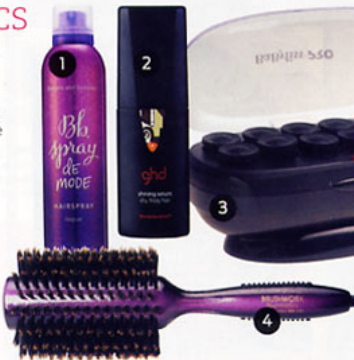
1 Bumble & Bumble BB Spray De Mode Hairspray, $54. 2 Ghd Shining Serum, $35. 3 BaBylissPRO Jumbo Ceramic/Titanium Hot Roller Set, 12pc, $109.95. 4 Brushworx Tourmaline Radial Brush, Medium, $21.95.

Once rollers are cool, brush out curls and arrange around your face. When hair is in place, add a touch of gloss to ends to prevent fly-aways.