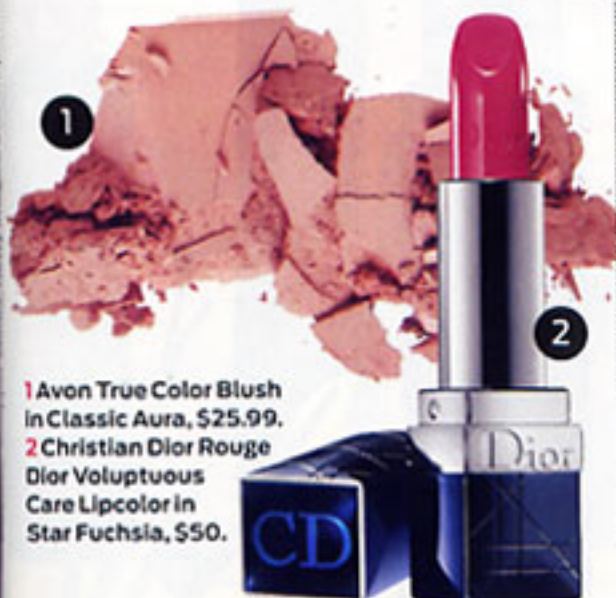
1 Avon True Color Blush in Classic Aura, $25.99. 2 Christian Dior Rouge Dior Voluptuous Care Lipcolor in Star Fuchsia, $50.

Cheeks Smile at the mirror and blend a sheer pink blush onto the apple of your cheeks in circular movements. Remember, less is more at this year's awards.