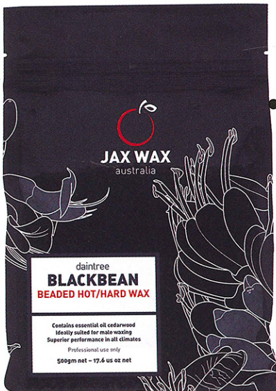
Jax Wax Daintree Blackbean Beaded Hot Wax Jax Wax Australia 03 5943 2422