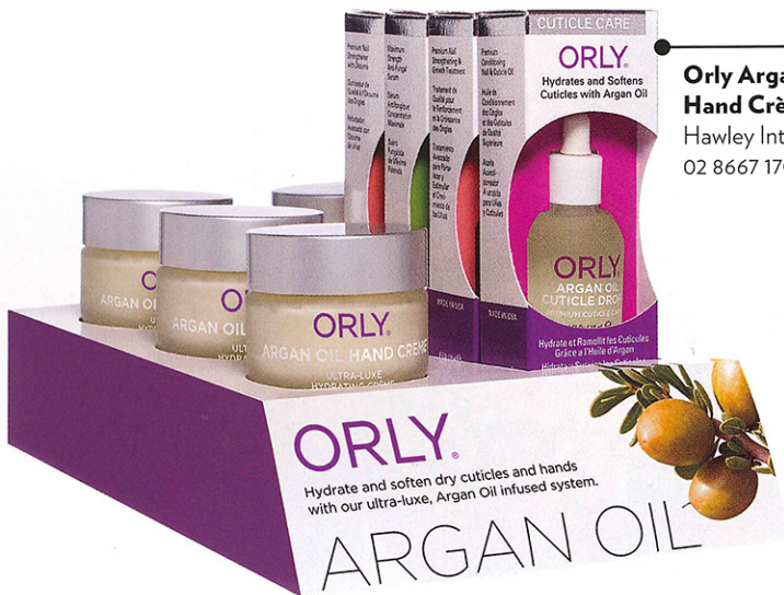
Orly Argan Oil Hand Crème and Cuticle Oil Hawley International 02 8667 1700