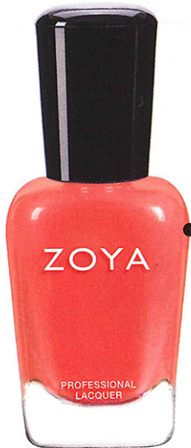
Zoya Professional Lacquer in Cora SA Beauty Supplies 1300 855 644