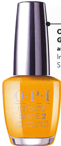
OPI Infinite Shine 2 Gel Lacquer in Sun Sea and Sand in My Pants International Beauty Supplies 1800 358 999