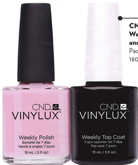
CND Vinylux Cake Pop Weekly Polish and Weekly Top Coat Pacific Nail & Beauty 1800 672 800