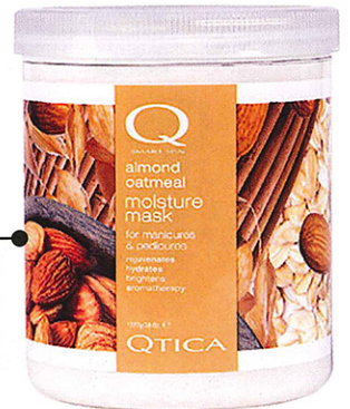
Qitica Almond Oatmeal Moisture Mask SA Beauty Supplies 1300 855 644