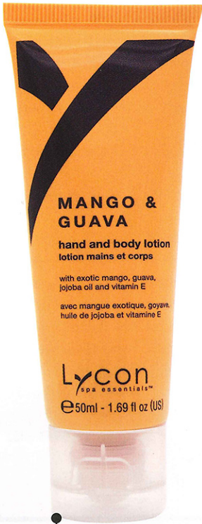
Lycon Mango and Guava Hand and Body Lotion Lycon 07 3004 6200