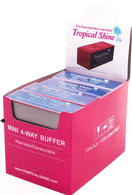
Tropical Shine Mini Four-Way Buffer Block Display Dateline Imports 02 9666 3611