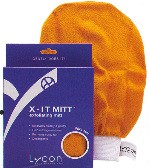
Lycon X-It-Mitt Lycon 07 3004 6200