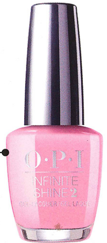
OPI Infinite Shine 2 Gel Lacquer in Tagus in That Selfie International Beauty Supplies 1800 358 999