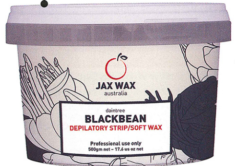
Jax Wax Daintree Blackbean Strip Wax Jax Wax Australia 03 5943 2422