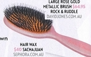
LARGE ROSE GOLD METALLIC BRUSH $64.95 ROCK & RUDDLE DAVIDJONES.COM.AU

▶ Curl hair using a small curling tong - twist small pieces of hair in random directions to get a more undone vibe.