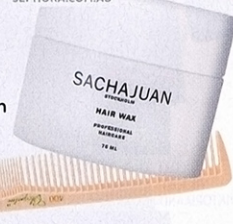
CLEOPATRA COMB $5.45 KRESTI-GLAMOUR.COM

▶ Apply hair wax from the roots to the crown, and then use a fine-tooth comb to slick the hair back into place towards the crown of your head.