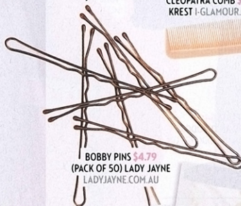
BOBBY PINS $4.79 (PACK OF 50) LADY JAYNE LADYJAYNE.COM.AU

▶ Starting level with the tops of your ears, slide in several bobby pins to create an even 'V' shape at the back of your head - finish with hairspray to hold.