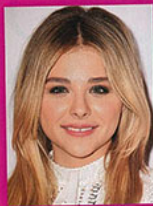
CHLOE GRACE MORETZ

'Chloe's shiny hair is her trademark look,' says Alison. 'Use styling tools with ceramic, ionic or tourmaline to seal the cuticle and reflect light.'