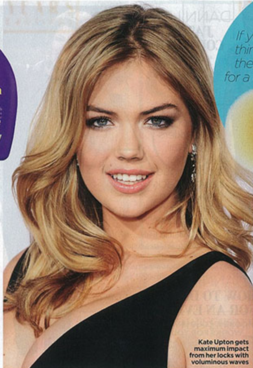
Kate Upton gets maximum impact from her locks with voluminous waves

Fighting against thin, limp locks? With our simple guide, you'll have thicker-looking, voluminous hair in no time. The first step is to create the best base from the get-go. That means a good, hard cleanse each time you wash, ensuring you rinse out all of your conditioner (this is a common culprit in weighing down your hair). Opt for ranges with plumping, thickening ingredients and leave-in treatments for added oomph.