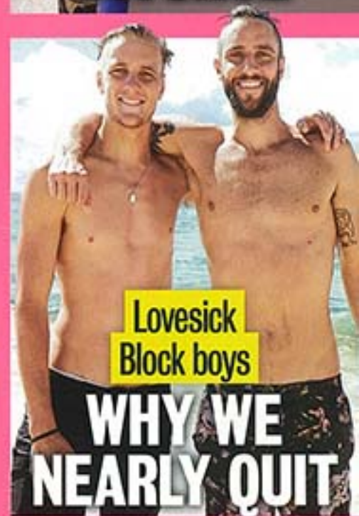
Lovesick Block boys