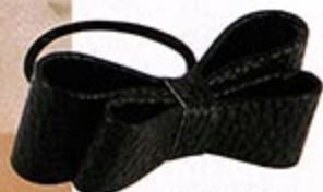
Faux Leather Black Elastic Bow $9.99 Lady Jayne ladyjayne.com.au