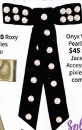
Onyx Velvet Pearl Bow $45 Jacenko Accessories pixiespix.com.au