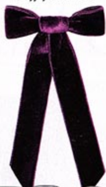
Velvet Bow Hairclip $139 Jennifer Behr net-a-porter.com