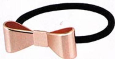
Rose Gold Metal Ponytail Bow $9.99 Lady Jayne ladyjayne.com.au

The best trends always boomerang back round – but to be honest, even we didn't see hair bows coming! Not just limited to preppy schoolgirls, rock a bow in a sleek low bun to complement pretty make-up, or try an adorned headband to keep annoying hair off your face. They're cool in every form, so even if you wanna go OTT like Ari, we support you.