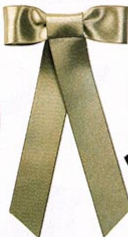
Satin Bow in Olive $30 Jacenko Accessories pixiespix.com.au