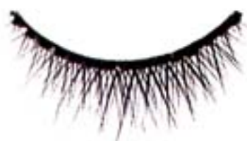
#52 SHU UEMURA Dazzling Black Diamante False Eyelashes, 02 9931 8888.