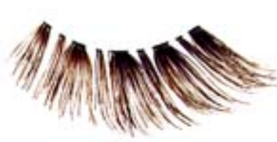
#18 M.A.C 2 Lash, maccosmetics.com.au.