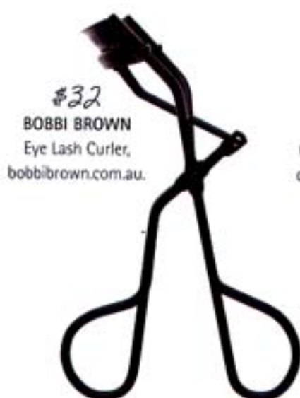
#32 BOBBI BROWN Eye Lash Curler, bobbibrown.com.au.