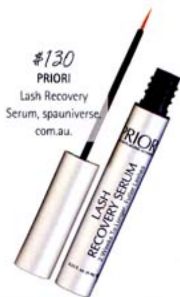
#130 PRIORI Lash Recovery Serum, spauniverse. com.au.