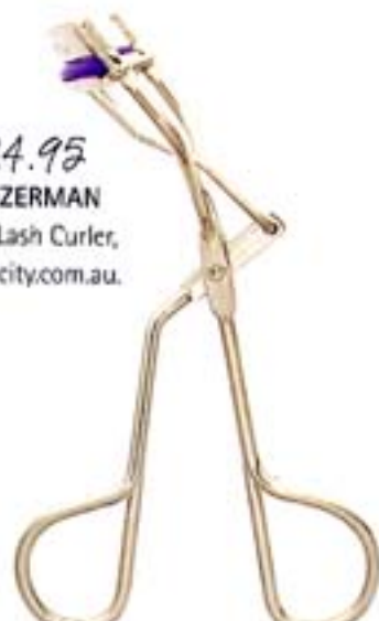
#24.95 TWEEZERMAN Classic Lash Curler, datelinecity.com.au.