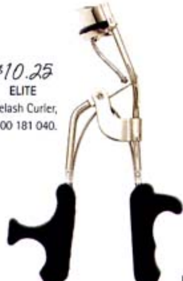
#10.25 ELITE Eyelash Curler, 1800 181 040.