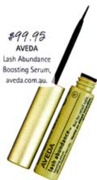
#99.95 AVEDA Lash Abundance Boosting Serum, aveda.com.au.