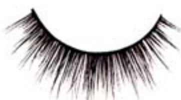
#39.95 LOVE THOSE LASHES Siberian Mink lashes in Audrey, lovethoselashes.com.au.