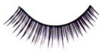
#15 NAPOLEON PERDIS Lash in Hoya, napoleonperdis.com.