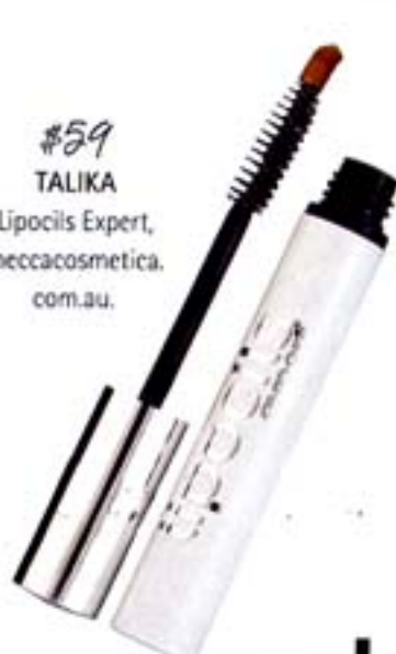
#59 TALIKA Lipocils Expert, meccacosmetica. com.au.