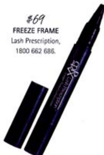
#69 FREEZE FRAME Lash Prescription, 1800 662 686.