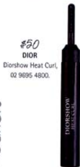
#50 DIOR Diorshow Heat Curl, 02 9695 4800.