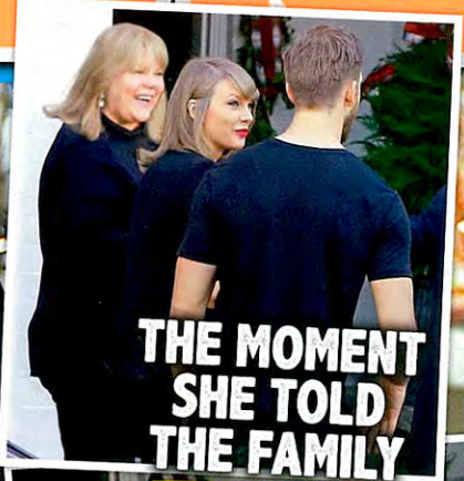
THE MOMENT SHE TOLD THE FAMILY