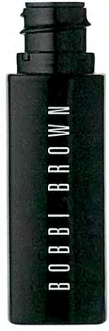
BOBBI BROWN INTENSIVE SKIN SERUM CONCEALER, $59, BOBBIBROWN.COM.AU

"WHEN OTHER PEOPLE ARE PUTTING [MAKEUP] ON ME, IT'S THE GREATEST THING IN THE ENTIRE WORLD - OTHERWISE, I LIKE TO KEEP THINGS SIMPLE WITH JUST A COUPLE OF PRODUCTS." - JENNIFER