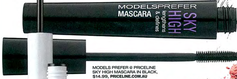
MODELS PREFER @ PRICELINE SKY HIGH MASCARA IN BLACK, $14.99, PRICELINE.COM.AU