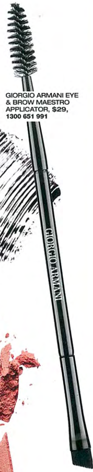
GIORGIO ARMANI EYE & BROW MAESTRO APPLICATOR, $29, 1300 651 991