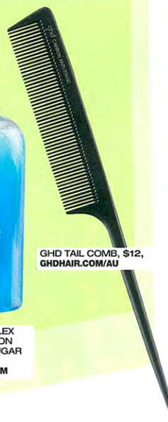
GHD TAIL COMB, $12, GHDHAIR.COM/AU