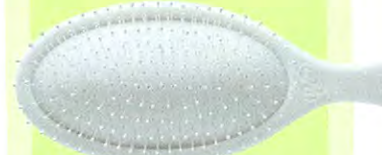
THE WET BRUSH WET BRUSH DETANGLING HAIR BRUSH IN PASTEL WHITE, $14.95, DATELINECITY.COM