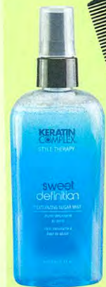
KERATIN COMPLEX SWEET DEFINITION TEXTURIZING SUGAR MIST, $31.95, DATELINECITY.COM