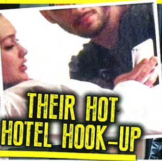
THEIR HOT HOTEL HOOK-UP