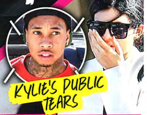
KYLIE'S PUBLIC TEARS