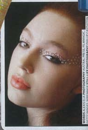
WORDS: MELISSA PHOTOGRAPHY/ALISTAIR PRESS, FILMIMAGE, GETTY IMAGES, WHITEIMAGE, STYL-STILE PHOTOGRAPHY/PHILIP CASTLETON

HOT TIP Customise a plain glitter polish by applying it over the top of one of your favourite coloured lacquers.