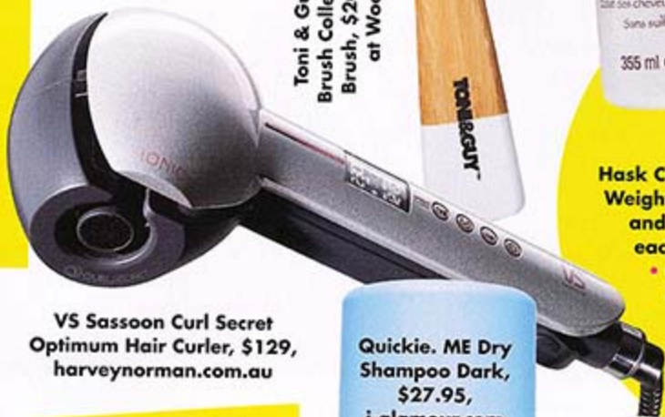
VS Sassoon Curl Secret Optimum Hair Curler, $129, harveynorman.com.au

EXPERT TIP: "TRY CURLING YOUR HAIR INWARDS, RATHER THAN OUT TO REALLY EMBRACE THIS LOOK, AND USE A PADDLE BRUSH TO SMOOTH HAIR, OR A WIDE-TOOTH COMB FOR A MORE TOUSLED CURL."