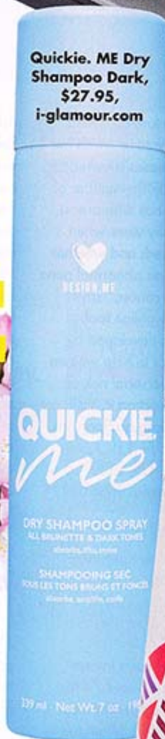
Quickie. ME Dry Shampoo Dark, $27.95, i-glamour.com

"The more flat wave style curl is definitely a big hit - this means hair sits closer to the head/face, more flat than the flicked-out look which can give a 'pageant hair' vibe. The flat wave gives more of a modern ripple wave effect," claims Michael.