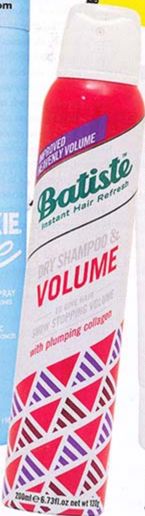
Batiste Hair Benefits Dry Shampoo & Volume, $12.95, batistehair.com.au

Hask Cucumber Aloe Water Weightless Shine Shampoo and Conditioner, $14.99 each, available at Coles Combining aloe vera and cucumber water this new formula is lightweight on hair while nourishing and adding shine.