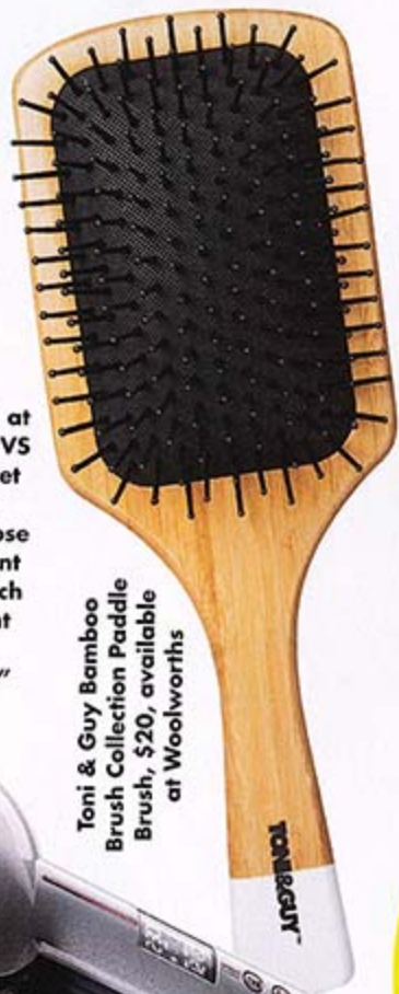
Toni & Guy Bamboo Brush Collection Paddle Brush, $20, available at Woolworths